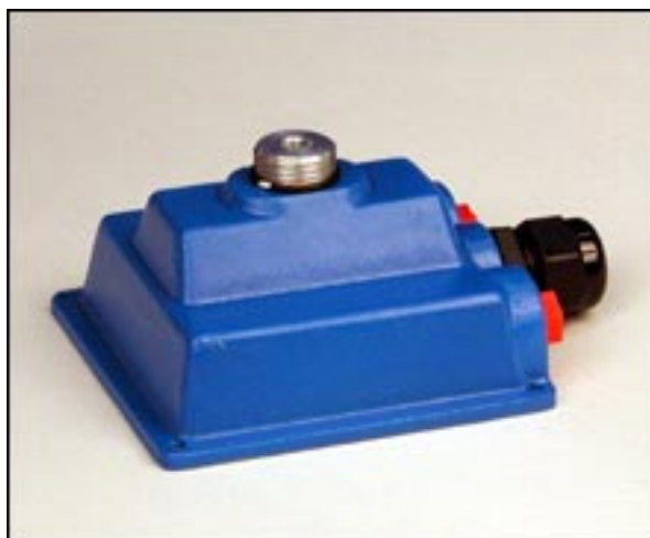
MK10 Adapter Kit

SeaMetrics offers two mounting kits, which address the need for a more modular housing system. The photos show how a flow computer (FT415, FT420) analog transmitter (AO55) or pulse divider (PD10) can be mounted on an IP or TX 80-Series flow sensor using an MK10.