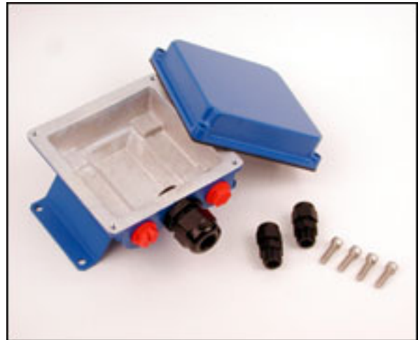
MK20 Mounting Kit

The housings themselves are the same rugged, fusion coated cast aluminum enclosures used on other products. The electronic modules are physically interchangeable.