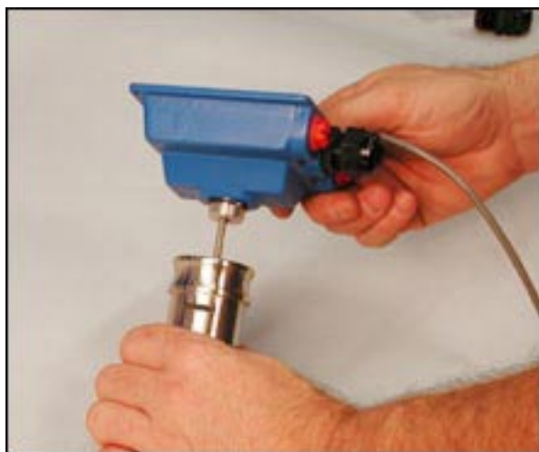
2. Attach MK10