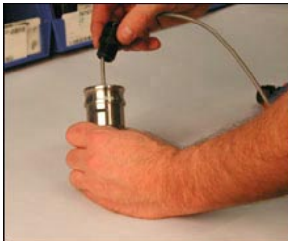
1. Remove Strain Relief from the 80 Series Meter