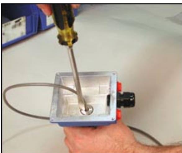
3. Tighten with Screwdriver, Cut Wire to Length