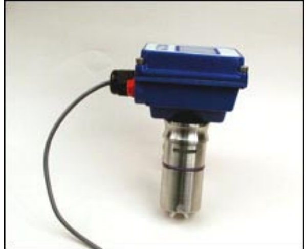
Assembled Meter with Electronics